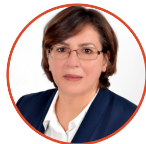
Mama EL RHAZI UNIVERSITY HASSAN II OF CASABLANCA, MOROCCO